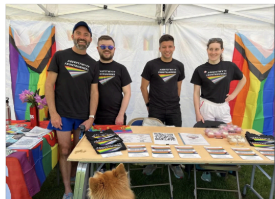
Aberystwyth Fronrunners stall at pride